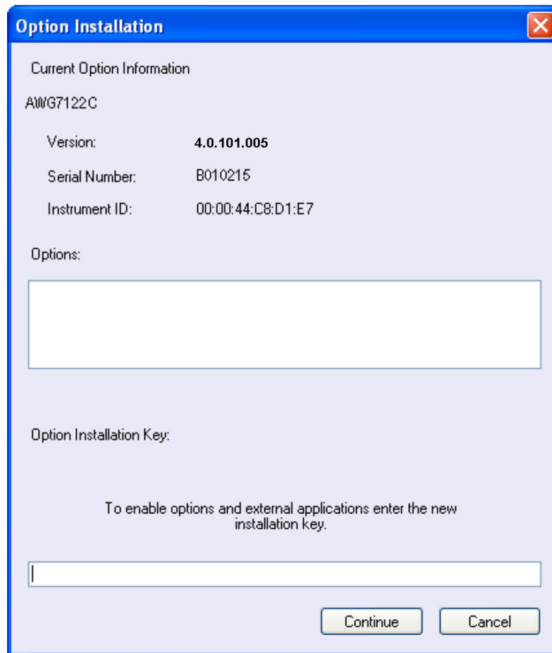
Figure 2: Option Installation dialog box (2)